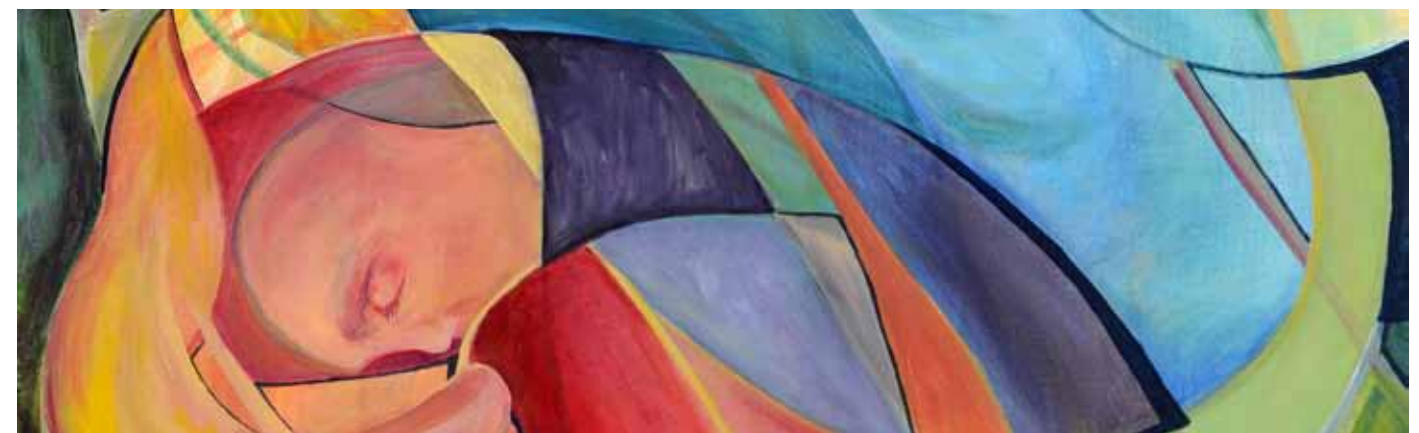
Couple in bed: Raquel Schwaeler - Warringah Art Exhibition entrant