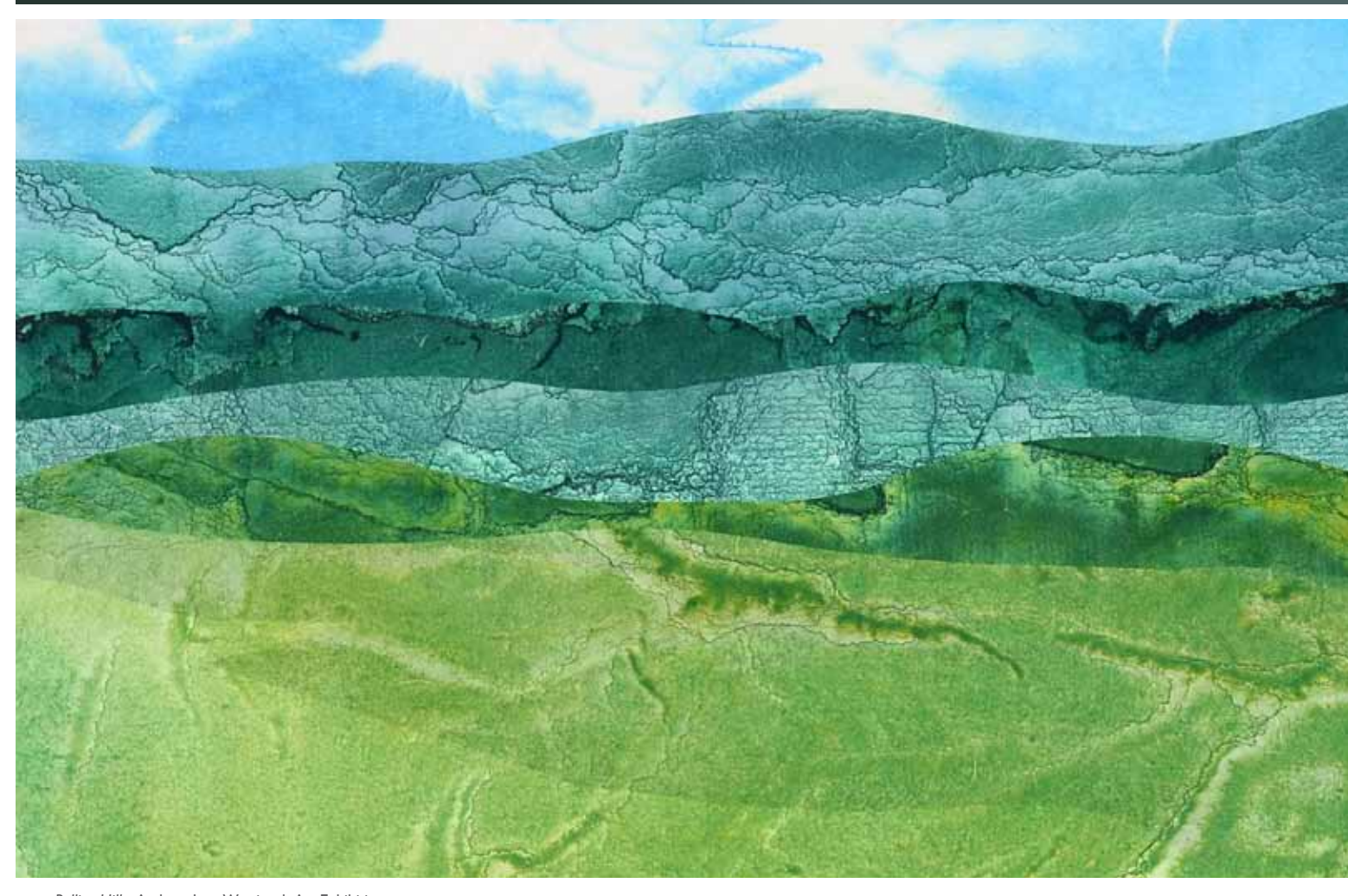
Rolling Hills: Andrew Lo - Warringah Art Exhibition entrant