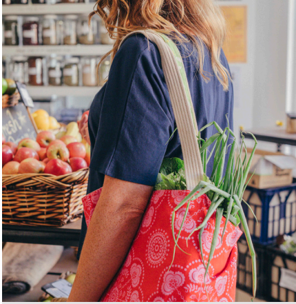
Ask customers "Did you BYO Bag?"

Make the swap and wipe out single-use plastics on the Northern Beaches. Support and empower your BYO-eautiful customers. Follow these steps to swap out plastic bags .