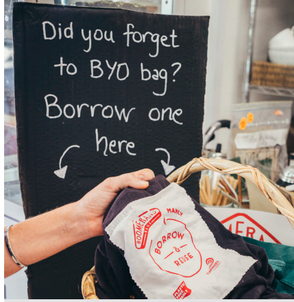
Sell or incentivise your customers to BYO reusable bags