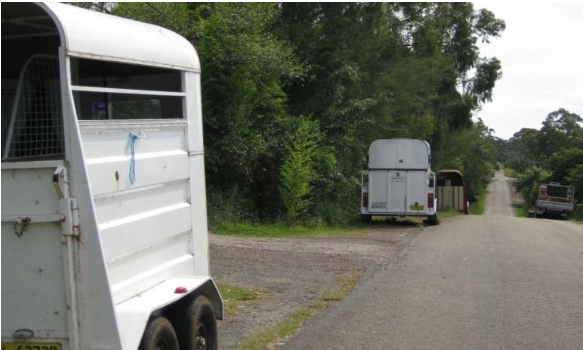
Horse floats in Mallowa Road

It is noted that the parking of horse floats as indicated is not an illegal practice. To address this issue however, Council should continue to monitor the roads and road verges for the increased presence of horse floats and traffic, identify any major issues including restriction of horse usage/access as well as dangers to other road users and, where appropriate, take further action to address public safety concerns.