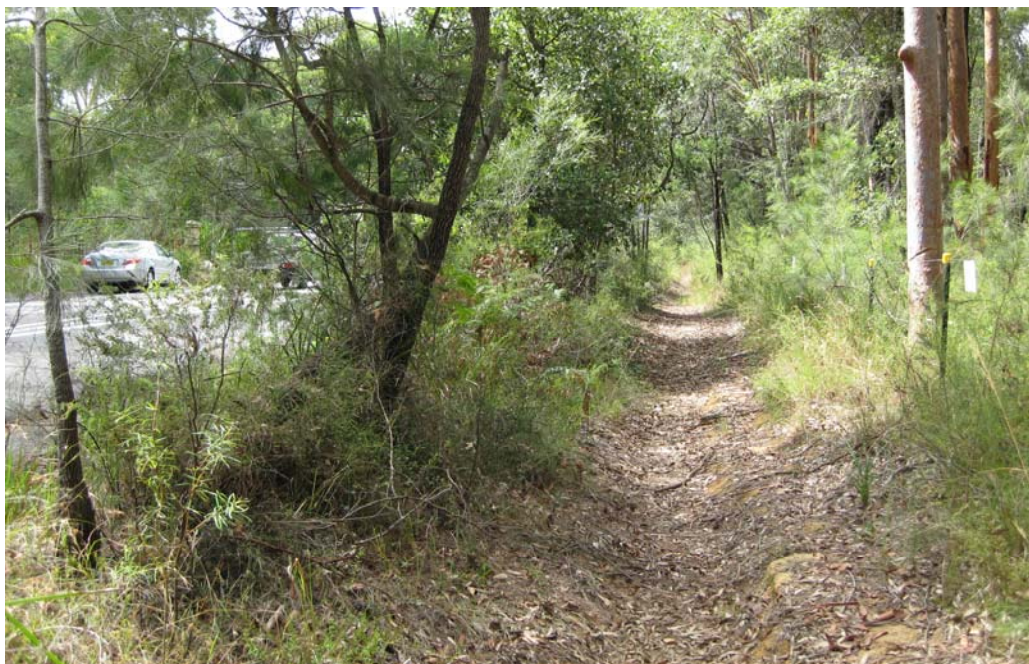
The Bridle Trail

Regular maintenance on the trail should then be conducted in accordance with the specifications in the REF.