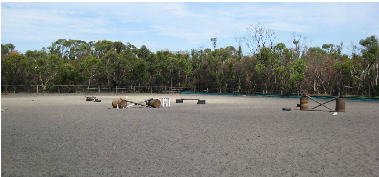
The arena at Anembo Reserve

Council provides large arenas at both Anembo and JJ Melbourne Hills Reserves. There are also clubhouse facilities at JJ Melbourne Hills Reserve and a small horse riding area within Kinka Reserve. There are numerous smaller private arenas, riding schools and horse stables throughout the area, indicating a strong involvement in horses and riding in this area. In practice, most roadside verges are used to access these areas.