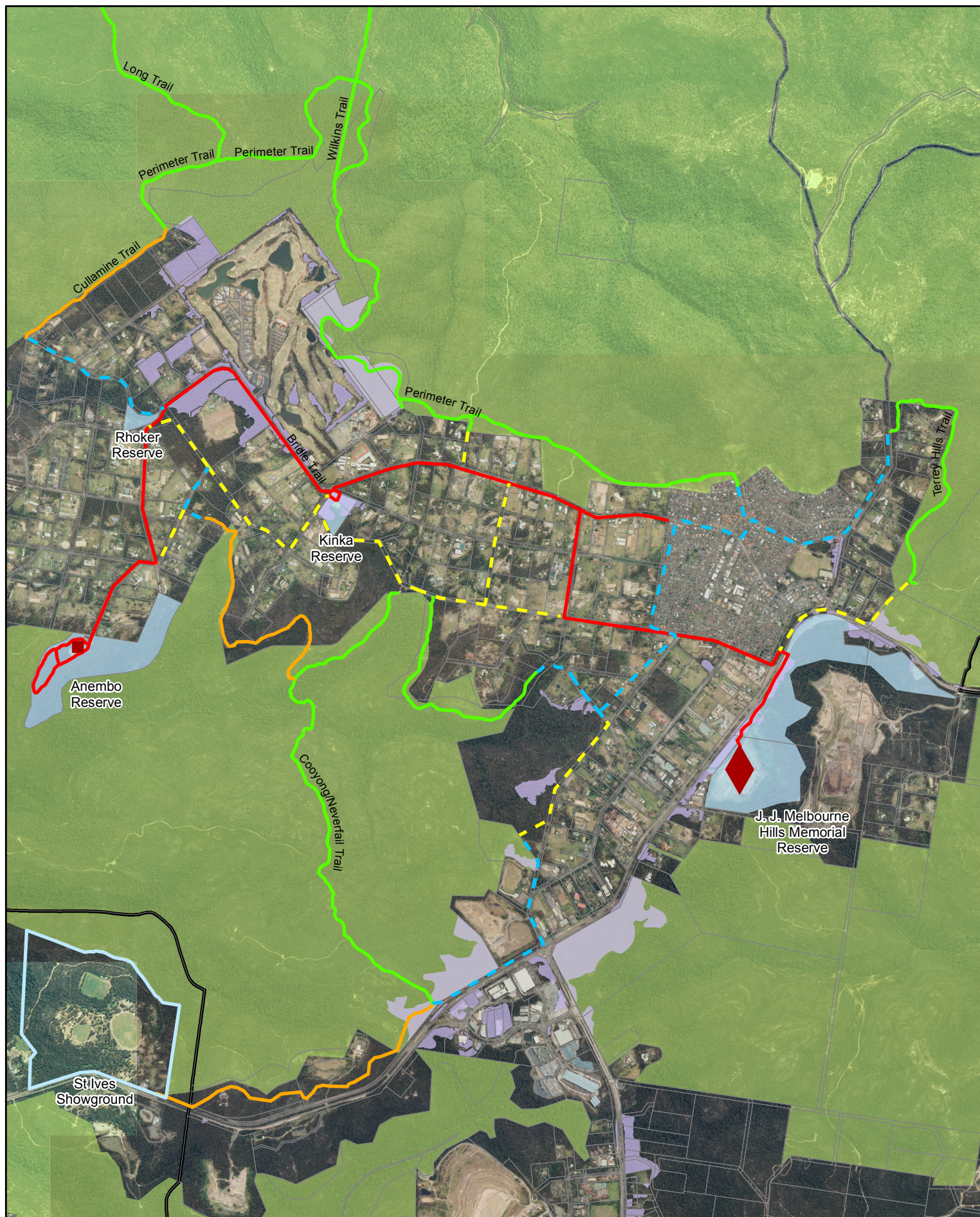
Map 1 Existing and possible future horse trails in Terrey Hills and Duffys Forest