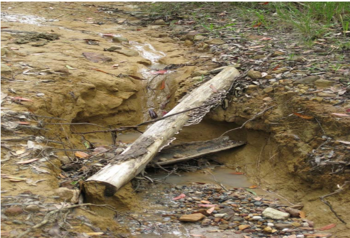
Erosion along the trail in Weemala Road (Unformed Crown Road)

During consultation for the preparation of this Paper it had been suggested that it may be possible to avoid the most difficult parts of Booralie Road by re-routing the Bridle Trail. A possible alternative route (see Map) is to divert the Bridle Trail down Kinka, Weemala and Killawarra Roads (which is already used by horses) to Anembo Road, and to close and rehabilitate the trail along Booralie Road beyond Kinka Reserve. To maintain access to Booralie Road and the Cullamine trail consideration could be given to formalising a trail through the section of Weemala adjacent to the NSW Gun Club, although a safe road crossing would be required on Booralie Road. Notably, Weemala is a crown road and permission would need to be sought for any development and use. This section of Weemala Road is known as the 'Weemala Link', identified in Warringah's Multiple Use Trail Strategy. The unformed trail in Weemala Road appears to be used regularly by horses and is considerable erosion along the trail (see photo). This would require immediate rectification and ongoing maintenance if it is to be a safe and environmentally sustainable option.