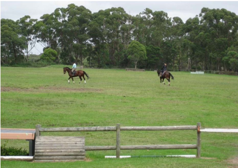
Horses at JJ Melbourne Hills Reserve

JJ Melbourne Hill Reserve has an arena with a clubhouse for the Forest Hills Pony Club and associated infrastructure as well as jumps in the reserve. It is used almost every weekend of the year and on various week days. There is also a trail to the underpass. There are a number of actions in the Plan of Management that relate to the upgrading, relocation or maintenance of equestrian facilities. On the whole these actions are in hand.