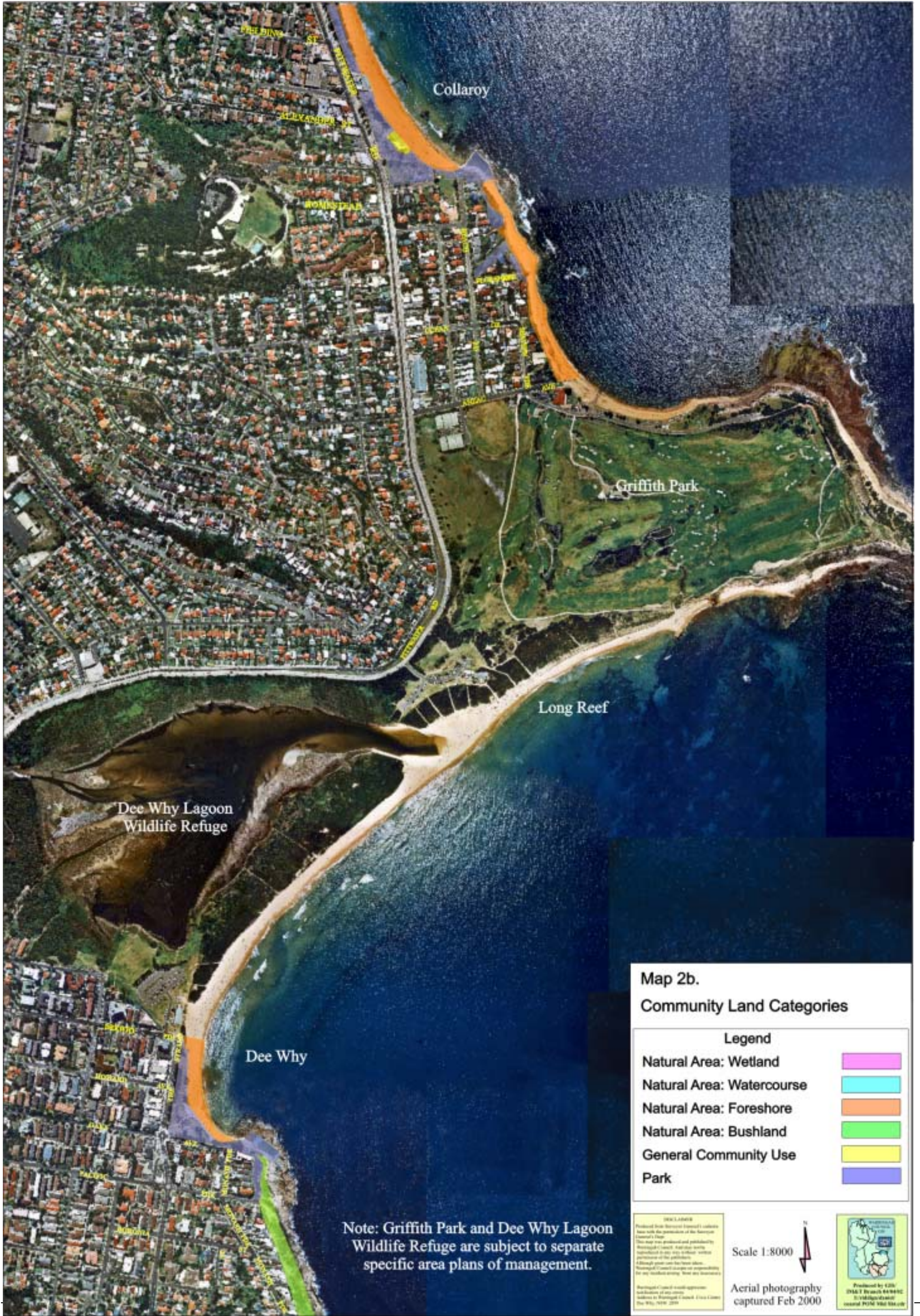
Map 2b. Community Land Categories