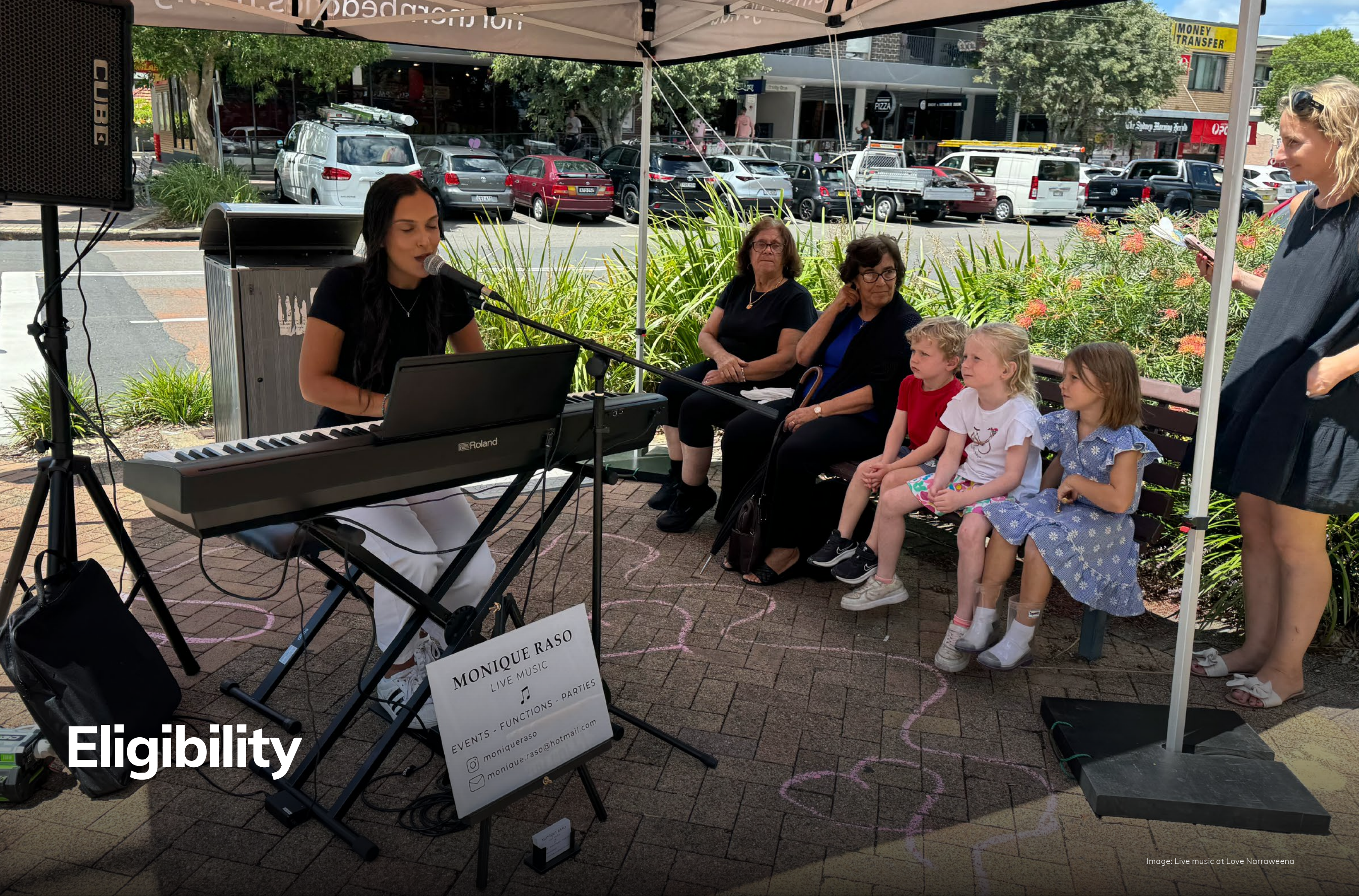
Image: Live music at Love Narraweena