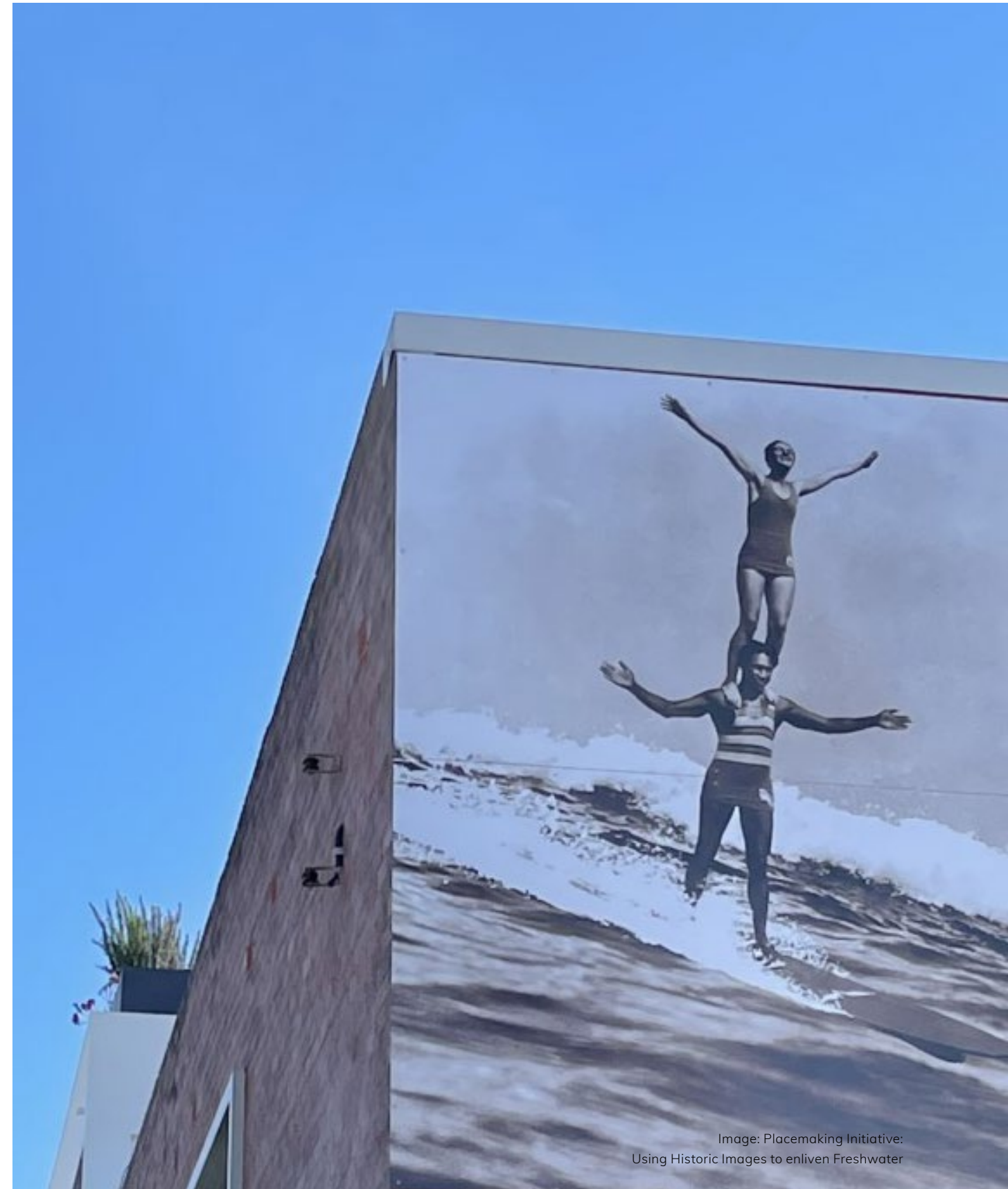
Image: Placemaking Initiative: Using Historic Images to enliven Freshwater

We will ensure that grant processes are transparent and fair. Applications are assessed objectively against the assessment criteria. Conflicts of interests are to be declared as part of this process.